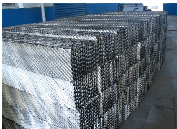
Illustration 3: Metal Structured Packing(KPK-MSP)