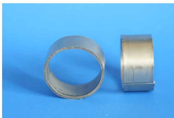
Illustration 7: Metal Raschig Ring(KPK-MRR)