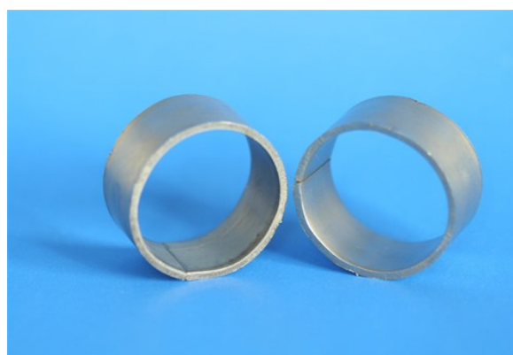
Illustration 8: Metal Raschig Ring(KPK-MRR)