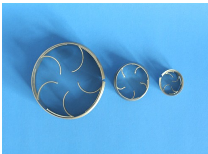
Illustration 10: Metal Cascade Mini Ring(KPK-MCMR)